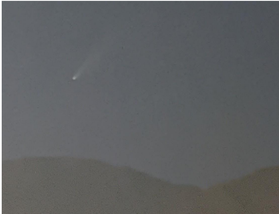
Comet Neowise C/2020 F3 seen from Southern California on July 17, 2020